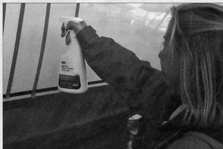
Above: 3M Black Streak Remover (pictured here) and Yacht Brite Serious Marine Cleaner failed to fully clean their streaked sections.

3M Marine , 877/366-2746, 3M.com Armada , 800/336-9320, armadacoatings.com Aurora , 866/214-3444, auroramarine.com Fantastik , 800/558-5252, fantastik.com Heller Glanz , 866/657-2624, hellerglanz.com Marykate , 800/272-8963, crcindustries.com Nautical Ease , 800/783-7507, nauticalease.com Spray Nine , 800/477-7299, spraynine.com Star brite , 800/327-8583, starbrite.com West Marine , 800/BOATING, westmarine.com Yacht Brite , 800/643-2316, yachtbrite.com